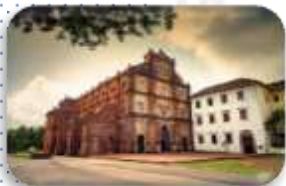
Basilica of Bom Jesus (world heritage)

Goa is a well-known and popular hotspot on the tourist map of India and the world. The name immediately brings to one's mind the lush green meadows, hills and valleys, the sea, and its attractive beaches. This charm and beauty set the right ambiance for BITS Pilani, K K Birla Goa Campus. Most of the tourist spots like popular beaches (Calangute, Baga, Colva, Palolem), Temples, Churches, and Hill-Stations are reachable within 1-2 hrs (or less) by cab or local bus. BITS Pilani, K K Birla Goa Campus, is about 10 km south of Vasco-da-Gama, 20 km north of Margao, and 7 km east of Goa Airport, along National Highway - 17B, Bypass road.